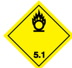
Class 5.1 HAZARD Oxidizing Substances

ADR , Annex A General provisions and provisions concerning dangerous substances and articles; Classification; Class Specific Provisions